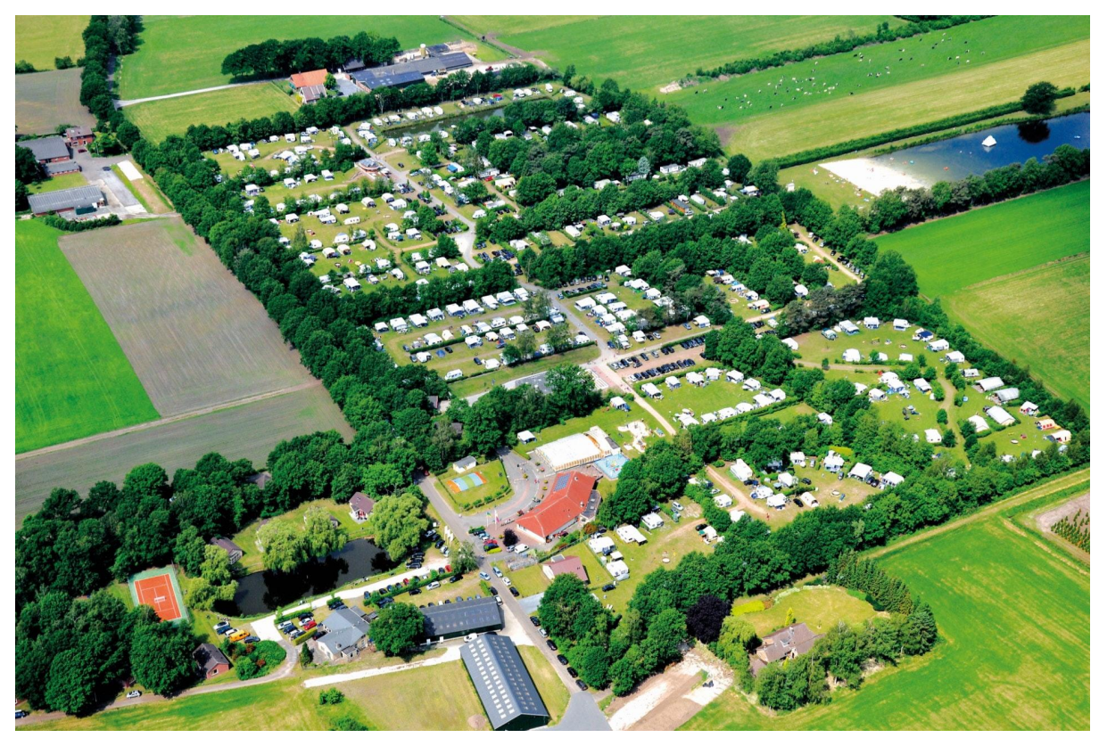
Also in the elite class of ADAC Superplätze in 2022: The 5-star Papillon Country Resort course

Berlin, 07.12.2021 - This year, the ADAC has again sent its inspectors to campsites all over Europe to check their quality. The most important result: With 28 new ADAC super campsites (+21%), the top group of European luxury camping has grown significantly. This brings the total number of 5-star rated campsites in Europe to 158. Uwe Frers, Managing Director of ADAC Camping: "28 new ADAC Superplätze show where the journey in camping is heading: higher quality for increasingly demanding campers." There has also been a strong increase in the number of 4 and 4.5 star campsites. 103 campsites have made the leap into this segment (1,373 campsites) and are pleased to have received the ADAC Tip award.